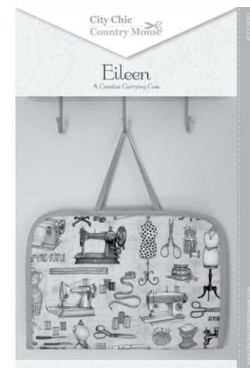
Eileen A Creative Carrying Case