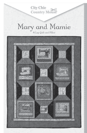
Mary and Mamie A Lap Quilt and Pillow