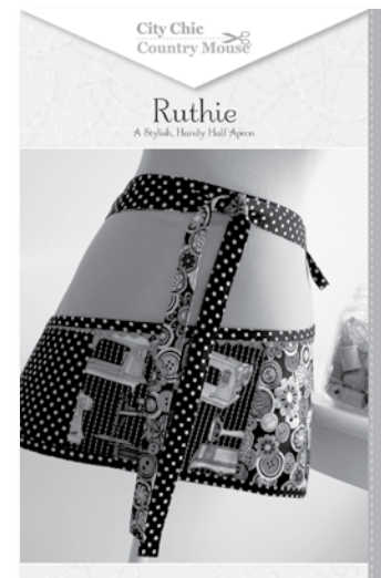
Ruthie A Stylish, Handy Half Apron